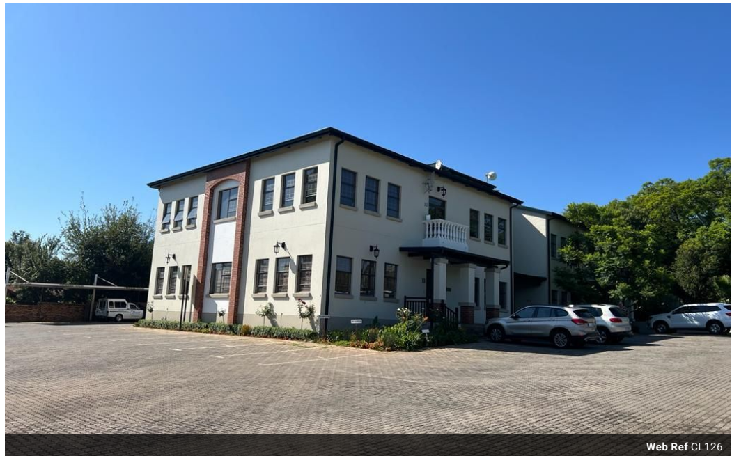
Web Ref CL126

Ground Floor The Place 1 Sandton Drive Sandton 2196